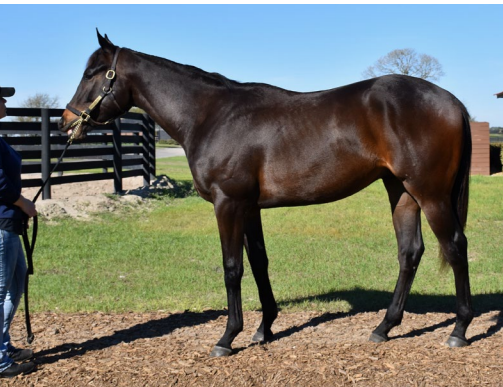
Brooklyn Diamonds as a two-year-old.

Last Race: 2nd, AOC-N1X Track: Oaklawn Trainer: Rodolphe Brisset Conditions Left: ALW-N1X