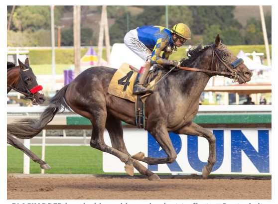
{\it BLACKADDER\ breaks\ his\ maiden\ going\ last-to-first\ at\ Santa\ Anita}.