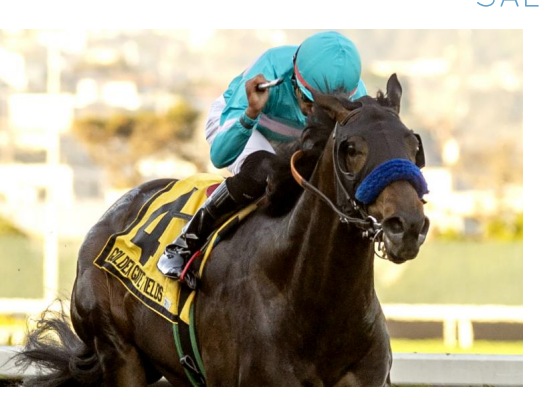
BLACKADDER storms home late to take the El Camino Real Derby.

Last Race: 4/9/22 - G1 Blue Grass S. @ KEE