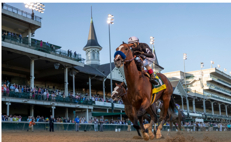
AUTHENTIC takes home the 2020 Run for the Roses.

The best progeny to date of super-sire and phenom INTO MISCHIEF , Authentic has been well supported in his first year at stud. INTO MISCHIEF continues to dominate the sire rankings and his sons are off to a good start at stud , represented by #3 first-crop sire PRACTICAL JOKE .