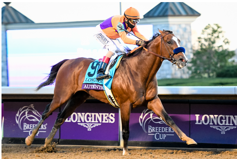
AUTHENTIC takes them wire-to-wire in the Classic.

SEVNTTEENIGHTYSEVN is offered this Keeneland November carrying her first foal by 2020 dual-champion AUTHENTIC .