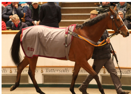
Etoile sells for 750,000 Guineas ($1,019,160) at the 2019 Tattersalls December Mare Sale.