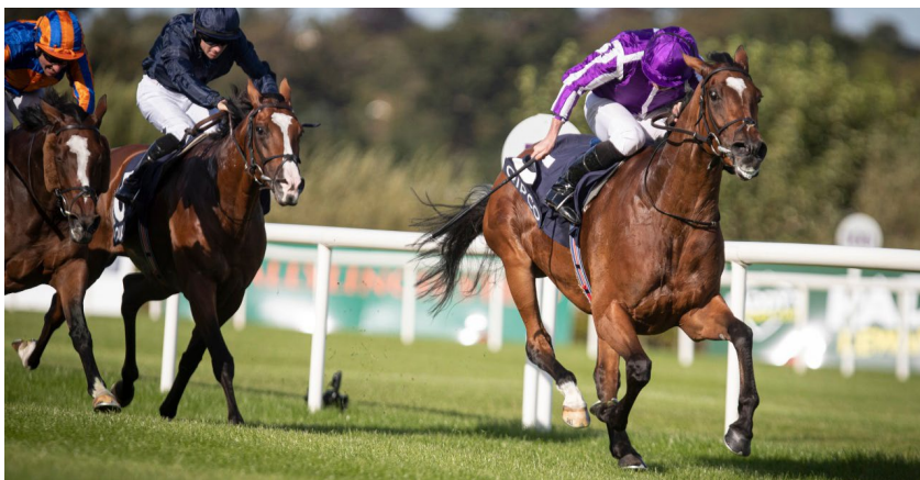
Magical wins the 2019 Irish Champion Stakes