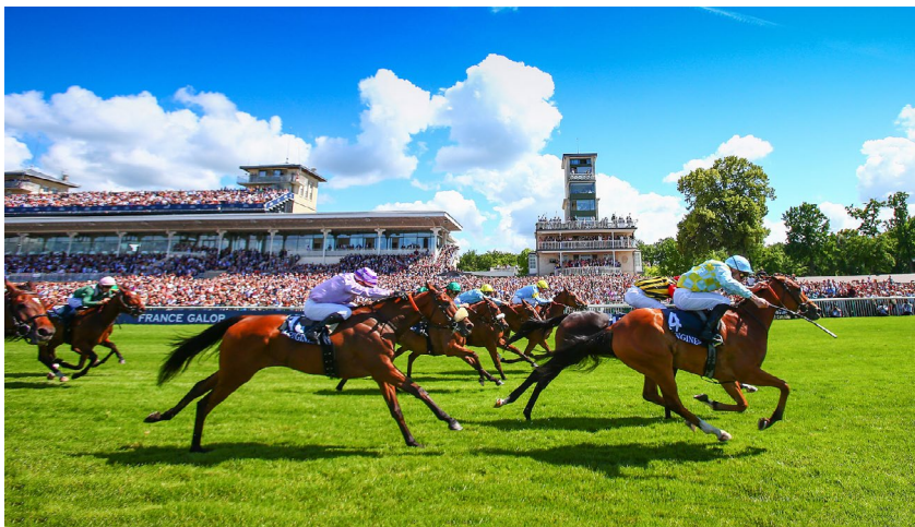
Etoile (fourth from left) is beaten just \frac{3}{4} of a length in the 2019 G1 French Oaks.

In addition to her 2 Graded/Group Stakes wins , ETOILE (FR) also placed in 3 additional Graded/Group races including the G3 Prix Vanteaux at Longchamp as a 3-year-old and 2 renditions of the G2 Dance Smartly as a 4- and 5-year-old.