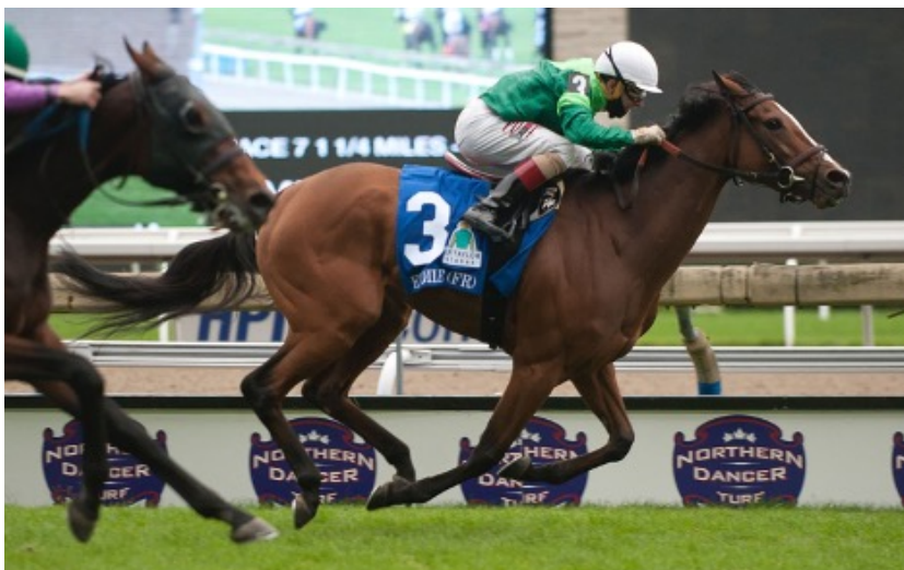
Etoile (FR) (left) wins the 2020 G1 E.P. Taylor at Woodbine.

As a 3-year-old in France, she won the G3 Prix Cleopatre at Saint-Cloud by 1-3/4 lengths which earned her a spot in the G1 Prix de Diane (French Oaks) . In her first test against G1 company, ETOILE (FR) flew home late to finish just ¾ of a length behind the winner, CHANNEL , and future G1W GRAND GLORY .