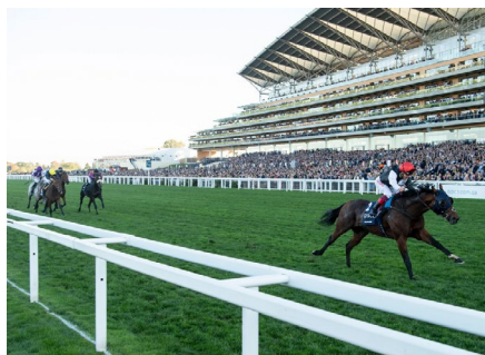
Cracksman wins the British Champion Stakes.