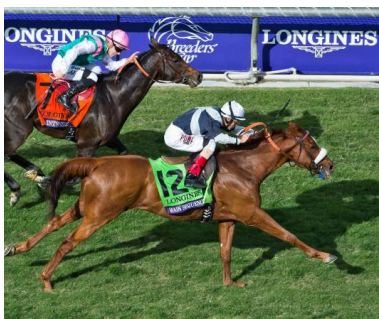
Main Sequence wins the Breeders' Cup Turf.