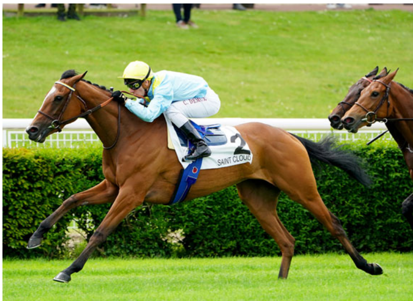
Etoile (FR) wins the G3 Prix Cleopatre.

In addition to her 2 Graded/Group Stakes wins , ETOILE (FR) also placed in 3 additional Graded/Group races including the G3 Prix Vanteaux at Longchamp as a 3-year-old and 2 renditions of the G2 Dance Smartly as a 4- and 5-year-old.