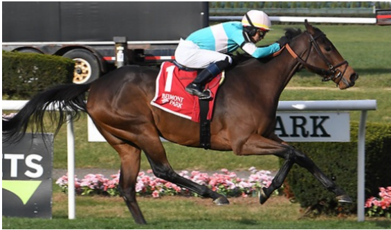
Split then Double (GB) airs by 4 ½ lengths in a Belmont Park maiden.

Last Race: $90,000 MSW, 11/07/21 Track: Belmont Trainer: Chad Brown Conditions Left: NW1X