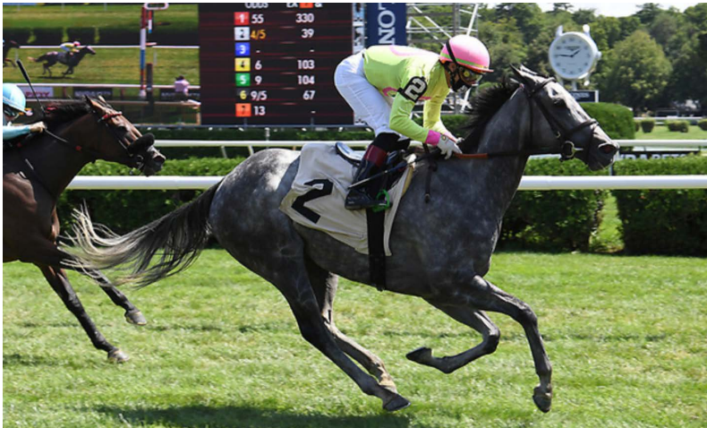
KEOTA rolls home a dominant winner of a Saratoga allowance.

KEOTA'S best performance came in the Captiva Island S. when she closed on multiple Stakes Winner GIRLS KNOW BEST to be second by just a half-length . That race saw her score a career-best 91 Beyer Speed Figure just one start after she had finished 3 rd in the Ladies Turf Sprint Stakes .