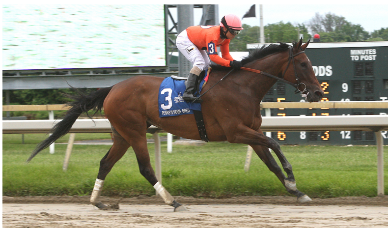
GREAT SOUL rolls home an easy allowance winner.

GREAT SOUL would come back the following year, stretching out to 1-1/16 miles where she earned her second stakes victory in the Mrs. Penny Stakes while registering multiple stakes placings in between the two victories.