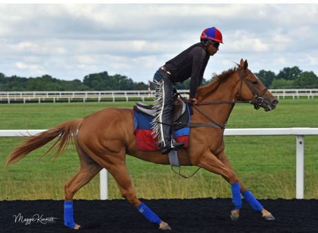
THE GINGER QUEEN training at Fair Hill.