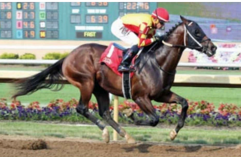
ROMANCER dominates the field by 6+ lengths.

Last Race: 6/29/21 MCL$25k at IND Result: 1st by 6 1/2-lengths Trainer: CSteve Asmussen Conditions Left: Alw-N1X /Str/Stk Preferred Surface: Dirt