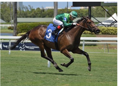
NORTH BROADWAY breaks her maiden.