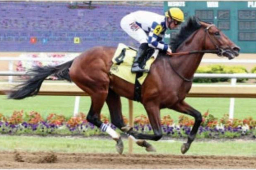
MYOPIC breaks his maiden on June 23, 2021.