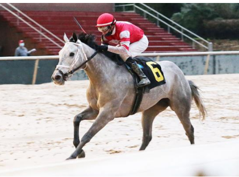
JOSIE wins her first start around 2-turns at OP.