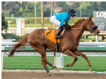
KALYPSO rolls home an easy winner of the G2 Santa Ynez in 2021.

She is also the half to two Graded producers who are responsible for G3P HERD IMMUNITY (3 rd - Bashford Manor) and G2W/G1P KALYPSO who has earned Graded placings in the G1 Starlet (2nd), G3 Las Virgenes (3rd), and G3 Santa Ysabel (3rd).