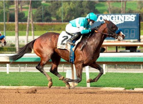
HOZIER breaking his maiden at Santa Anita.