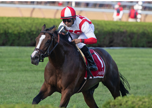
FRONT RUN THE FED wins the Better Talk Now at Saratoga.