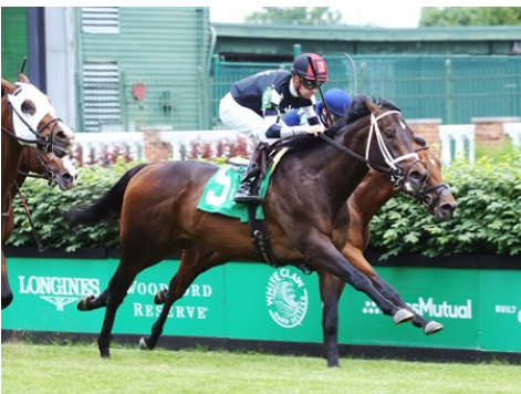
BURROW strides out a winner on May-16.

Last Race: 5/16/21 MdSpWt at CD Result: 1st by 1/2-length Trainer: Brad Cox Conditions Left: N1X Preferred Surface: Turf