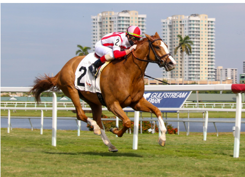
BACCHANALIA blitzes the field at Gulfstream.