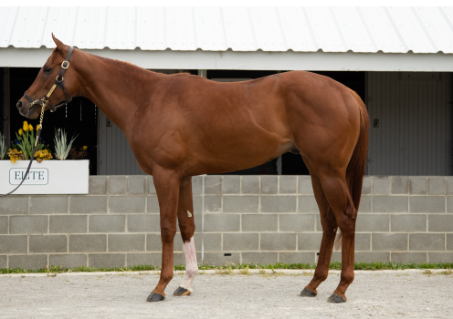
BORKAN at Keeneland.