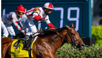
Digital Age wins the G1 Turf Classic at Churchill Downs