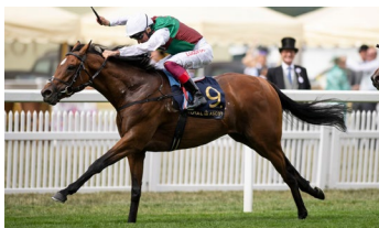
Without Parole wins the G12 St. James's Palace at Royal Ascot

Lemon Drop Kid has come on of late as a broodmare sire with his daughters producing top class horses on both dirt and turf. Most notably, daughters of Lemon Drop Kid have been responsible for G1 winners Digital Age and Without Parole as well as G1 Kentucky Derby contender Sainthood . Over the years, daughters of Lemon Drop Kid have been responsible for Breeders' Cup winners Forever Unbridled, Tamarkuz, Bar of Gold and Finest City .