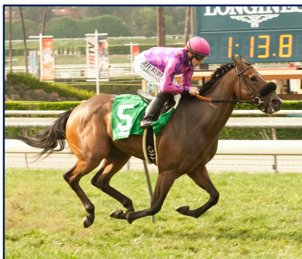
Long Hot Summer dominates at Santa Anita.