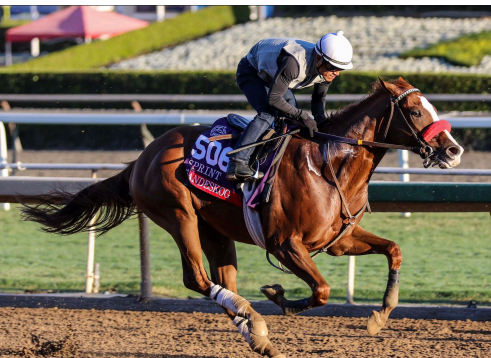
Landeskog training up to the 2019 BC Sprint.