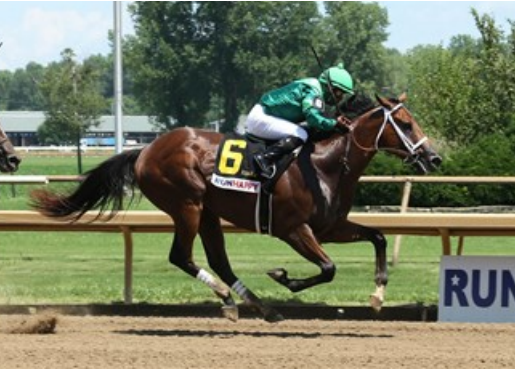
Notary goes gate-to-wire to break his maiden at Ellis.