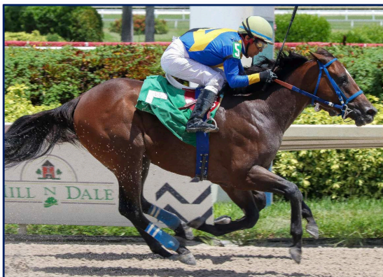
PERUVIAN DANCER breaks his maiden at GP.

As a producer, SOLARANA has produced 4 winners from 6 foals to race . Since the catalogue, her 2-year-old by Girolamo, PERUVIAN DANCER, has broken his maiden vs. MdSpWt company at Gulfstream Park .