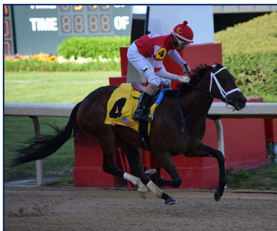
PERUVIAN APPEAL wins a salty allowance at Oaklawn.

After back-to-back wins, PERUVIAN APPEAL made her Graded Stakes debut in the G3 Victory Ride at Belmont . Sitting at the back of the pack over 6 lengths off the lead, she made her typical late run to finish 3rd while beating G1P BRILL . PERUVIAN APPEAL would get back to her winning ways in September at Churchill Downs, flying late to win a $99,000 purse allowance against a Stakes caliber field .