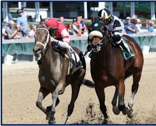
PERUVIAN APPEAL digs deep to defeat SW INTO TROUBLE.

Her sire, SUCCESSFUL APPEAL, has been a consistent broodmare sire throughout his career with daughters producing the likes of top-class, G1W sprinters as well as G1 Belmont Stakes winner TAPWRIT . PERUVIAN APPEAL had the precocity to