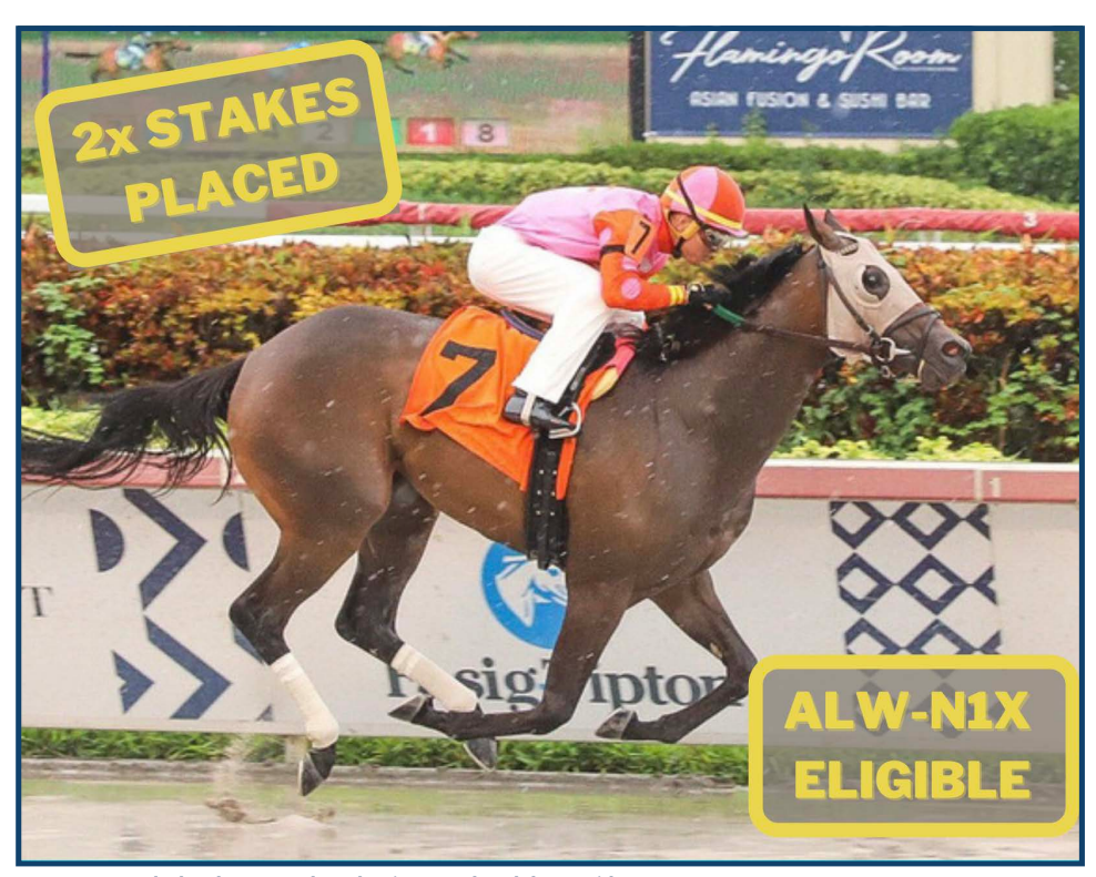
ISLA ROAD splashes home a 4-length winner to break her maiden.