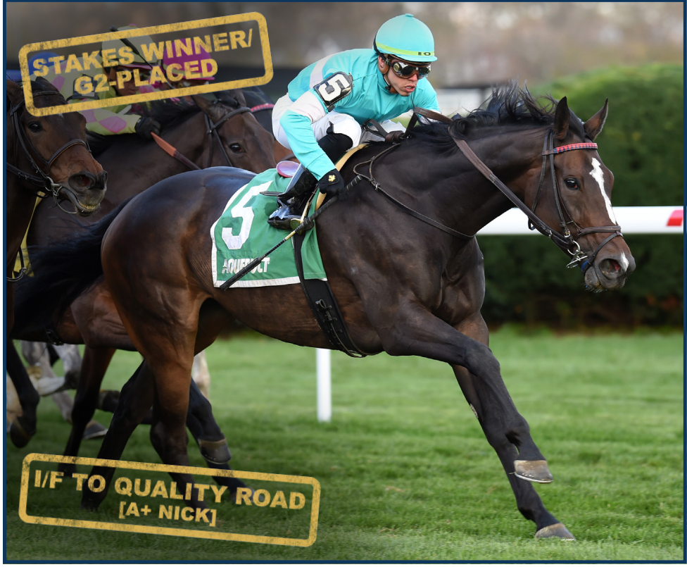
EMPRESSOF THE NILE takes the Zagora S. in New York