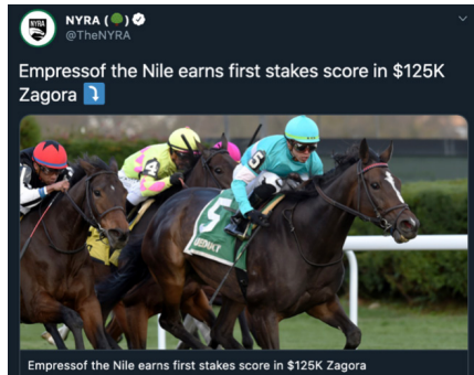
Empressof the Nile earns first stakes score in $125K Zagora | The New York Racing Association \mathcal{S} nyra.com

Of note, in her 4 starts on summer racing's biggest stage, Saratoga, she earned 2 wins and a 2nd in the G2 Glens Falls.