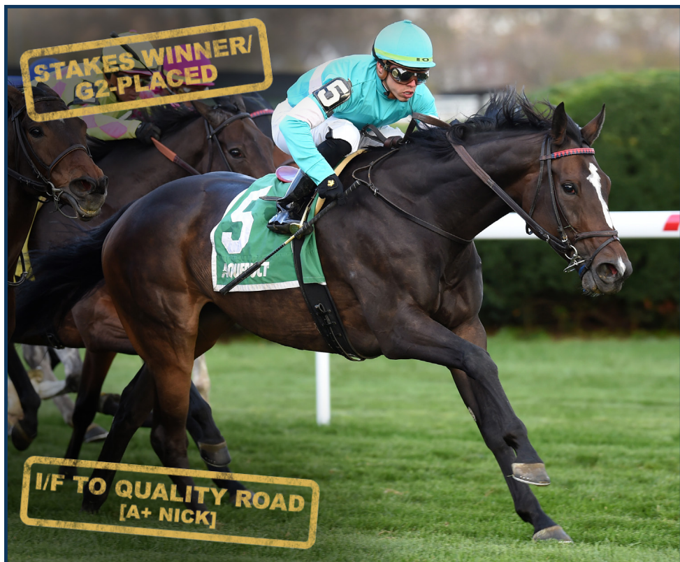
EMPRESS OF THE NILE takes the Zagora S. in New York