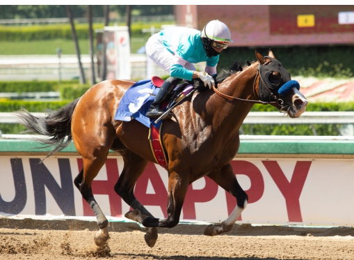
Ragtime Blues takes them gate-to-wire at Santa Anita.