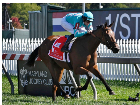
Fluffy Socks wins the Selima S.

ORIGINATOR is by the Breeders' Cup Mile winning ARTIE SCHILLER out of COSTUME DESIGNER (Capote) who has produced four winners to date . ORIGINATOR has two sisters of producing age including the 7-year-old BREAKFAST TIME (KITTEN'S JOY) whose 2-year-old filly FLUFFY SOCKS (Slumber) broke her maiden in a $90,000 MdSpWt at Kentucky Downs and followed that up with a win in the Selima S. at Pimlico on Preakness Day before being beaten by a nose in the Chelsey Flower S. at Belmont.