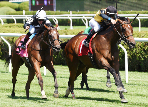
Originator wins a Saratoga allowance.

Last Race: 10/15/20 Alw-N2X @ KEE Trainer: Ian Wilkes Conditions Left: Alw-N2X Preferred Surface: Turf