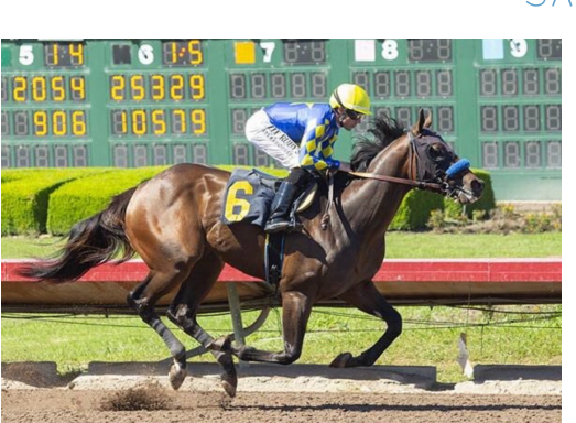
Mo Hawk breaks his maiden at Los Alamitos.