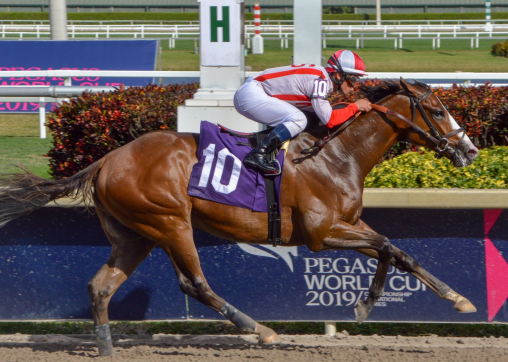
Growth Engine breaks his maiden at Gulfstream Park.