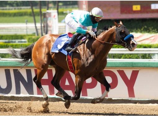
Ragtime Blues takes them gate-to-wire at Santa Anita.