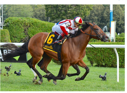
Catch a Bid wins the Riskaverse at Saratoga.