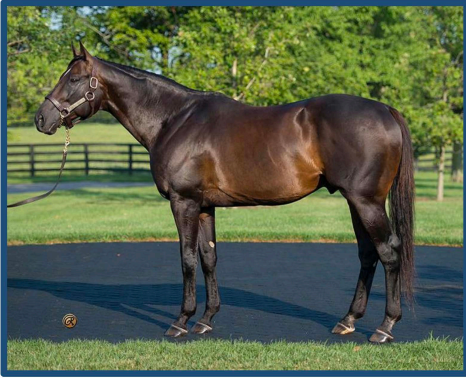
The late Pioneer of the Nile at WinStar.

By the late PIONEER OF THE NILE , the sire of our first Triple Crown winner in over 37 years, TOBAGO is owned by Eclipse Award nominated breeder Augustin Stable .