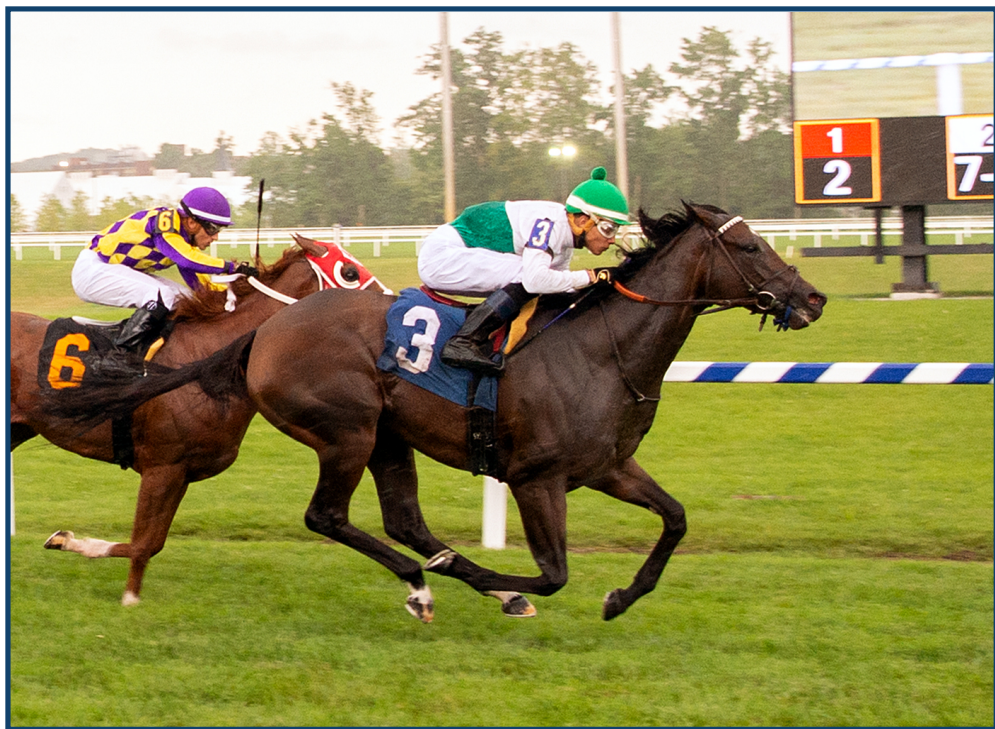
TOBAGO wins her Alw-N1X condition at Laurel Park.