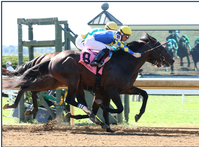
CZECHMIGHT takes them wire-to-wire to break his maiden at Keeneland.