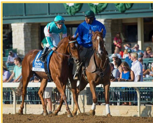
REFLECT in the post parade for the G1 Alcibiades.

In her first start around two-turns , in the G1 Alcibiades, REFLECT sat nearly 5-lengths off the lead before putting in a good run to make up lots of ground in the stretch ultimately finishing 2 nd ahead of G3W CATHERINETHEGREAT, G3W LADY T N T, and G3W CHOCOLATE KISSES.