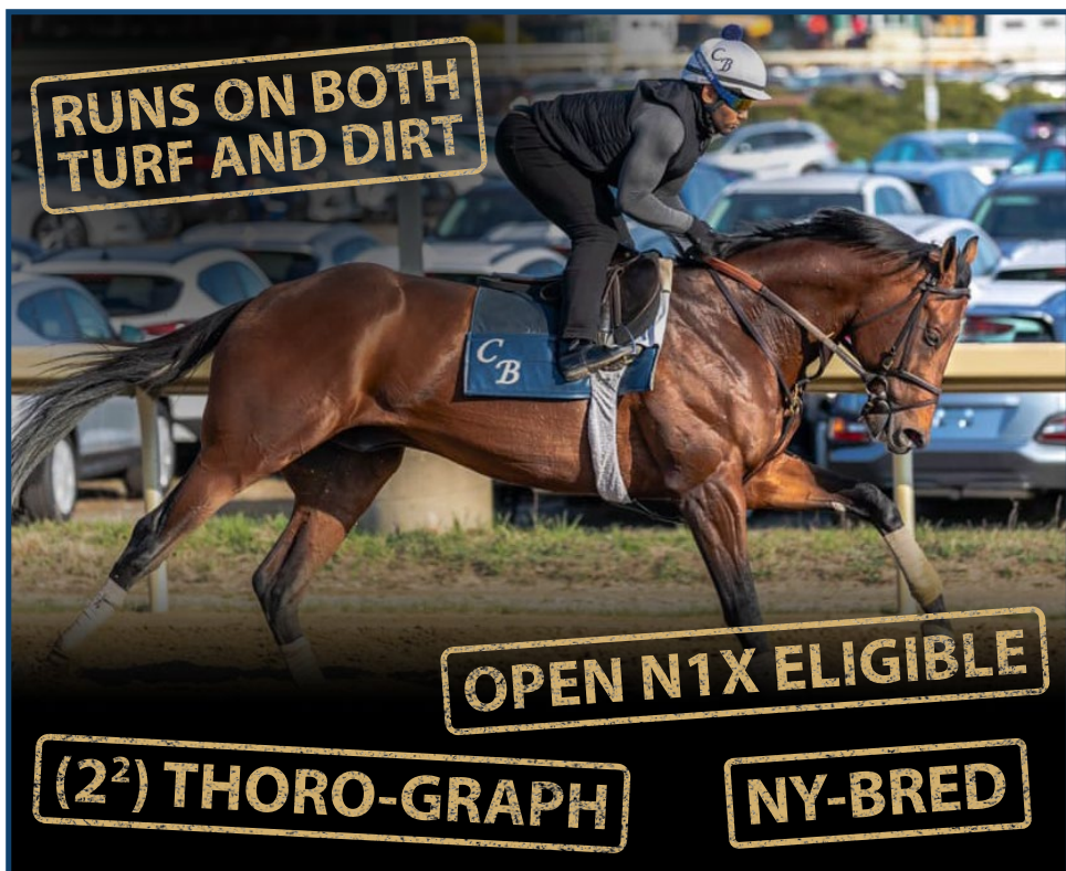
Minsky Moment training at Belmont Park