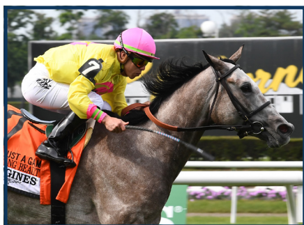
A RAVING BEAUTY

Won 2018 G1 Jenny Wiley at Keeneland with a 2 ½