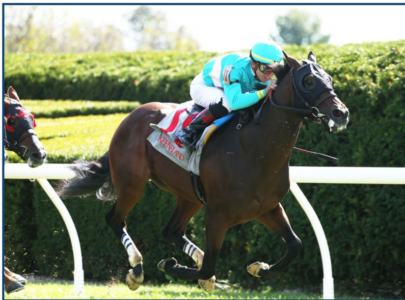
AFICIONADO digs in to break his maiden at Keeneland on October 17th.