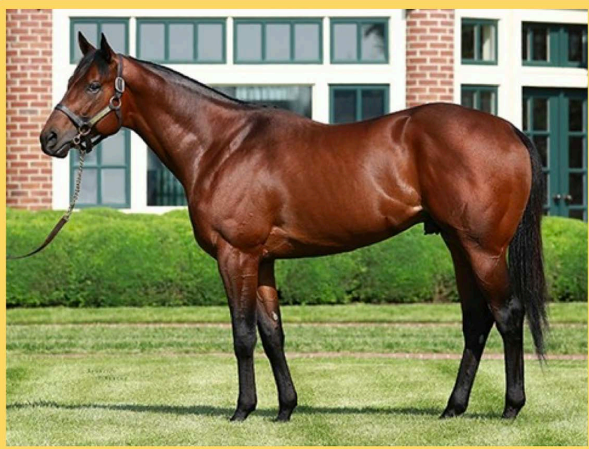
CITY OF LIGHT 🏠 standing at Lane's End in Kentucky.

A son of the #1 general sire ('19) and leading sire by G1 winners ('18), QUALITY ROAD , CITY OF LIGHT 🏠 is a physically identical replica of his sire. A Grade 1 winner at 3 ( Malibu ), 4 ( Triple Bend, Breeders' Cup Dirt Mile ), and 5 ( Pegasus World Cup ), CITY OF LIGHT paired back to back G1 wins to end his career including the G1 Breeders' Cup Dirt Mile.