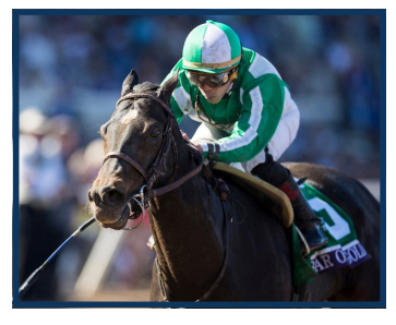
G1W BAR OF GOLD Won Breeders' Cup F/M Dirt Sprint with a 1 Thoro-Graph