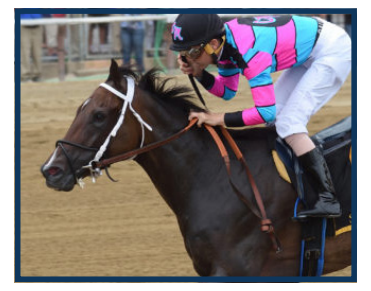
G1W FINLEY'SLUCKYCHARM Won G1 Madison with a 1 Thoro-Graph