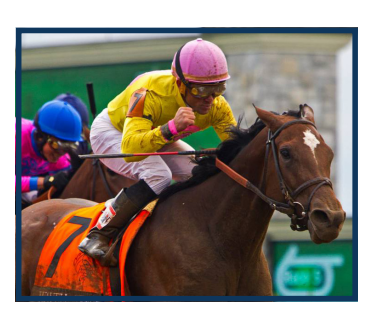
G1W WAVELL AVENUE 2nd in Breeders' Cup F/M Dirt Sprint with a 1 Thoro-Graph