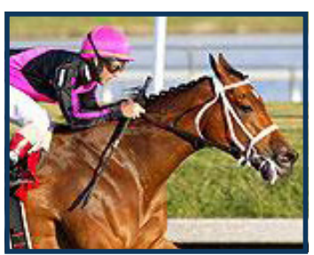
MADCAPESCAPADE (G1W) (o/o Sassy Pants)