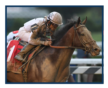
YOSHIDA (MG1W) (o/o Hilda's Passion)

Progeny of G2 Inside Information winners include: