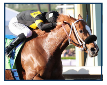
G1W FINEST CITY Won Breeders' Cup F/M Dirt Sprint with a 1 Thoro-Graph