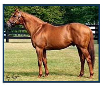
GOLDEN MISSILE (G1W) (o/o Santa Catalina)