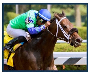
G1W BY THE MOON Won G1 Ballerina with a 1 Thoro-Graph