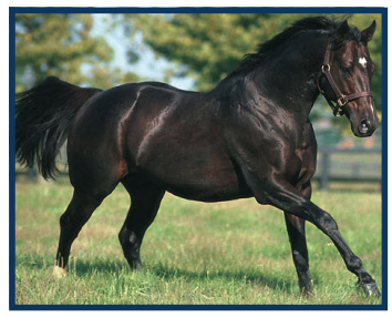
GONE WEST (G1W and Sire) (o/o Secrettame)