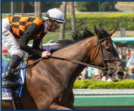
Multiple G1W PARADISE WOODS

Horses that broke their maiden going 1 turn on dirt at age 3 with a 5 Thoro-Graph :