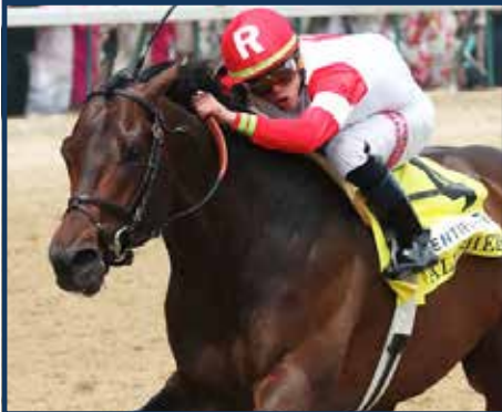
G2W BACKYARD HEAVEN