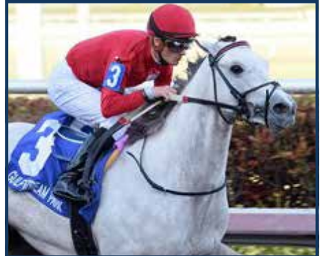
G3W MADISON'S LUNA

Since Blazen Betsy just broke her maiden at 6f, the natural progression would be for her to start out at 7f for her next start. The G3 Charles Town Oaks at Charles Town in late September looks to be a great spot for her: