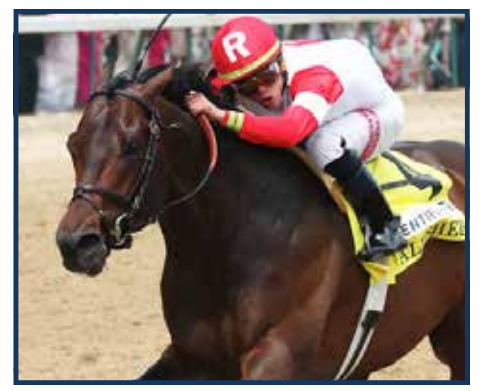
G2W BACKYARD HEAVEN