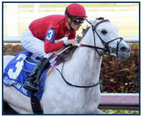
G3W MADISON'S LUNA

Since Blazen Betsy just broke her maiden at 6f, the natural progression would be for her to start out at 7f for her next start. The G3 Charles Town Oaks at Charles Town in late September looks to be a great spot for her: